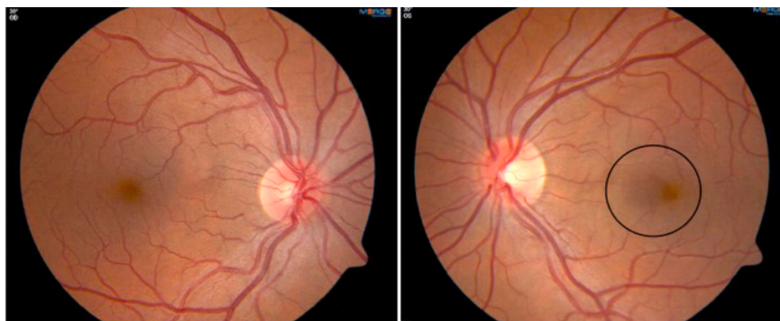
Figure 1. Fundus photographs demonstrated a reddish-brown, wedge-shaped lesion in the nasal macula of the left eye (right) and no abnormalities in the right eye (left).

The patient had a visual acuity of 20/20 in both eyes. The pupils were equal and reactive to light, no afferent pupillary defects were noted, and normal extraocular motility and confrontational visual fields were present.